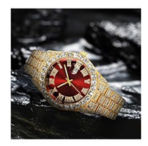
Full-drilled watches Strap are not only luxurious but also beautiful ,Easy to collocation,Suitable for any occasion

Every watch is Hand-made process to ensure product can be precious and shine more