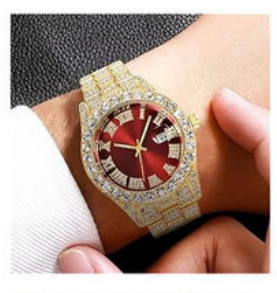
This is an Unique , beautiful watch, which is Luxury!which is attractive enough for daily wear or party.